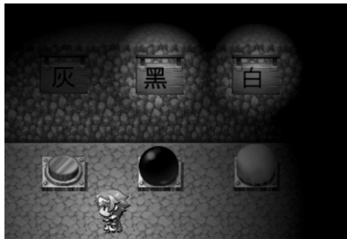
Figure 5. Matching Quest

In a similar puzzle the player must match the color of the boulder with the correct sign to open a gate to the final boss.