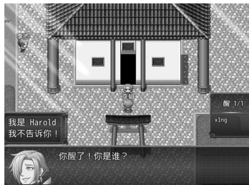
Figure 2. Glossing Tool

To complete quests and in-game tasks, players have a set of cards, items, and skills at their disposal. These in-game features include a language support mechanism in the form of a glossing system (W. Hong, 1997; Poole & Sung, 2016) that provides the Pinyin, a phonetic representation of Chinese characters. This particular DLI program had a strict policy against translating in the classroom and thus definitions were not provided in the glossing tool. Glossing tools have been shown to support reading fluency (Shen & Tsai, 2010; Xie & Tao, 2009) and improve reading comprehension (W. Hong 1997; J. Wang, 2009, 2012; J. Wang & Upton, 2012). The glossing system was implemented to support both vocabulary learning and reading comprehension. Further, past studies have shown that prompting learners to respond to in-game dialogue can promote positive metacognitive reading strategies (Poole et al, 2018).