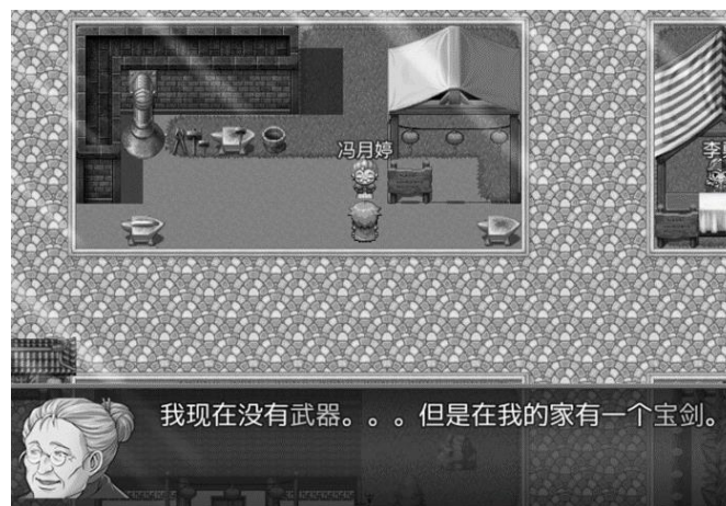
Figure 3. Sword Retrieval Quest

The quests involve a variety of puzzles, pick-up/delivery tasks, and enemy battling/taming activities. For example, one of the first quests that a player is given (see figure 3) is to retrieve a sword for a weaponsmith. The sword is located in the weapon smith's home which is demarcated with a sign.