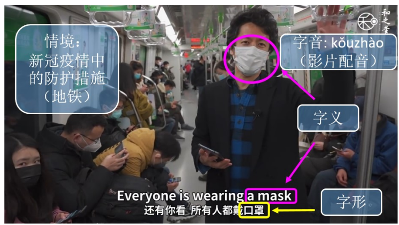
图 3 "口罩"一词在《感染者为 0 的城市—南京》中的呈现方式