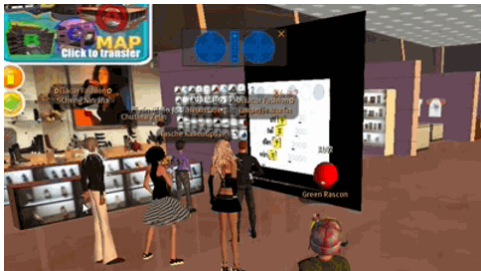
Figure 1: Airport and duty free shops

The primary Second Life island/region for this study, the Virtual Living Lab, was an on-going construction island designed for Mandarin Language learning built by a non-profit association in Taiwan, Institute for Information Industry. The target users of the VLL were Mandarin learners in the United States. According to Institute for Information Industry (2010), the mission of this 3D virtual learning environment is to build up a culture-enhanced Mandarin language environment to best simulate real-life learning experiences. The islands, scenes, as well as specific objects in the Living Lab were built around common topics including an airport, duty free shops, hotels, restaurants, a night-time market, streets, and a subway station.