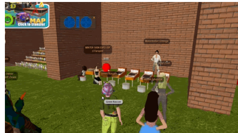
Figure 2: Night market