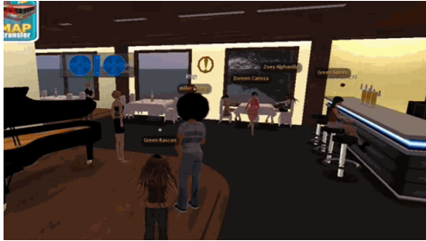
Figure 5: Restaurants