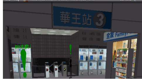
Figure 6: Subway