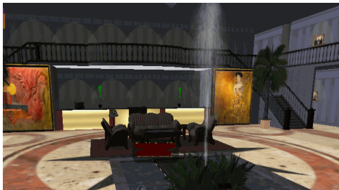
Figure 3: Hotel